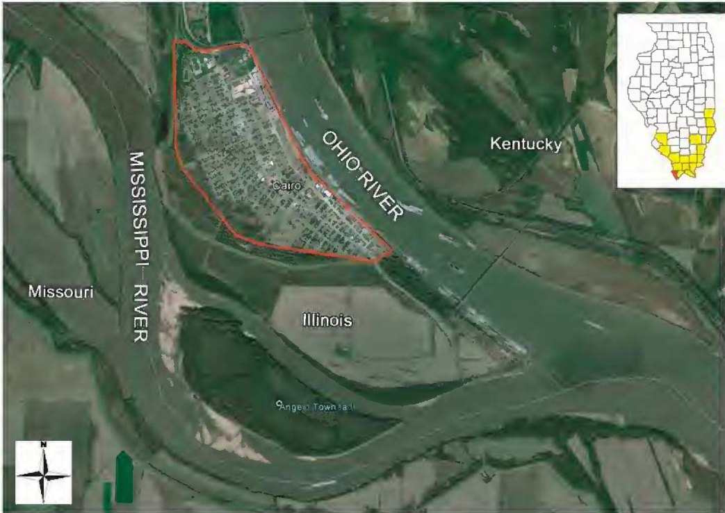
FIG. 1. Cairo incorporated city limits (red-lined boundary) in southern Alexander County near confluence of the Ohio and Mississippi Rivers.